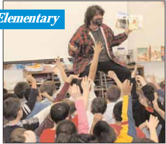
Professional wrestler and children’s author, Mick Foley, visited students at Medford Elementary School recently to read stories from his latest book, Tales from Wrescal Lane . The children enjoyed the stories and interacted with the multi-talented athlete, author, and father of four.