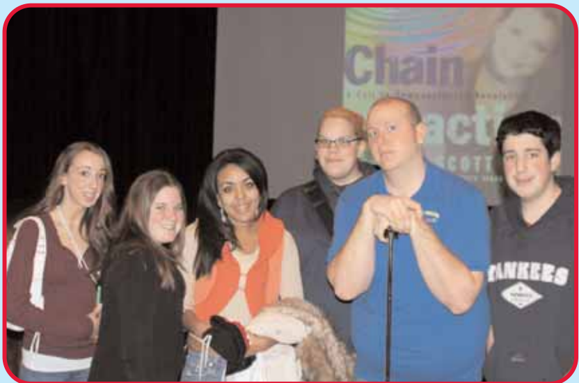
PMHS students listened attentively to the powerful message and story of Rachel Scott (face seen on the big screen in the background) a victim of the Columbine School disaster. They were also challenged to improve their school’s climate through the powerful message Rachel left as her legacy.

Students were clearly moved by the presentation, with some staying after the assembly to speak individually with the presenter. One student stated that she has a copy of an essay written by Rachel and is working to fulfill the challenges, while another student stated that while he considers himself a shy person, he makes an effort to help others out because “it’s the right thing to do.”